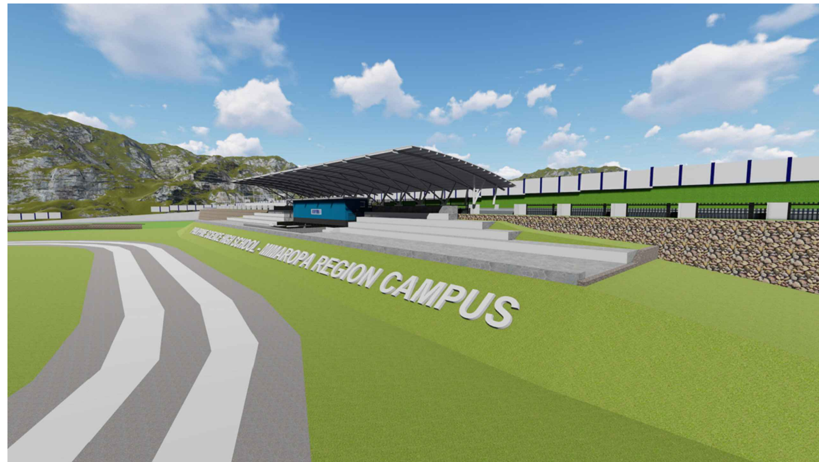
PHILIPPINE SCIENCE HIGH SCHOOL - MIMAROPA REGION CAMPUS PERSPECTIVE SCALE: _____ NTS