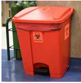
Red sharps biohazard