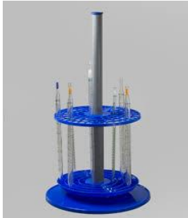
Circular Pipet Stand