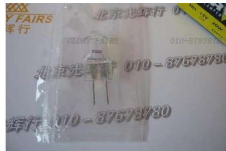
Halogen Lamp, NA55917 12V