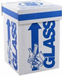
Glass Disposal Box