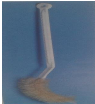
Beaker, bottle, flask brush