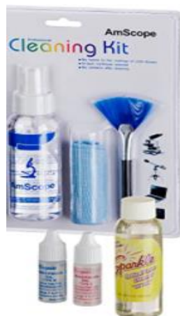
Microscope Cleaning Kit