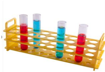
Test Tube Rack