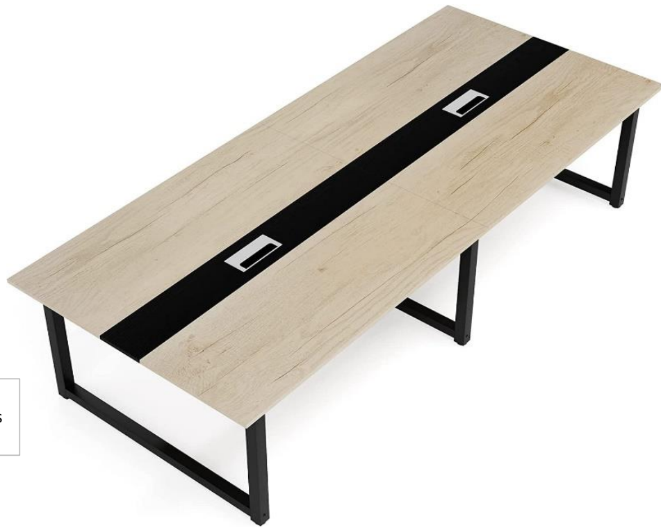
Conference table and chairs